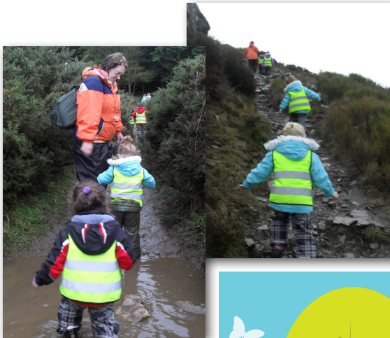
Left: Young adventurers from Ringsend Crèche enjoying the great outdoors as part of the centre's innovative programme.

This was the first year that we played Rummikub and it was a huge success. It is a fast paced numbers game that children and adults can both enjoy and was on lots of Santa lists last Christmas following the NCI Challenge!