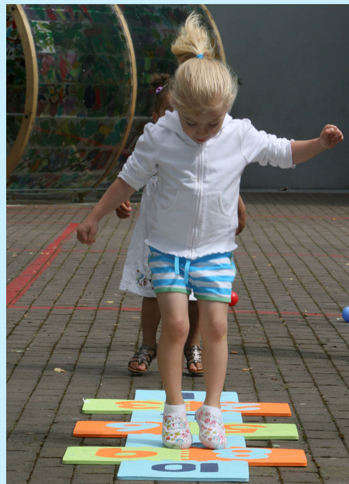
Above: Pre-schooler from Docklands enjoys a game of hopscotch at a play session at NCI