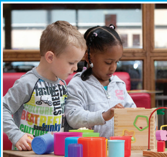
Pre-schoolers from Docklands exploring shape and space during their play session at NCI

We are looking forward to working with children, parents, ECCE practitioners, and the wider community. Children will have the opportunity to take part in a variety of exciting early numeracy activities: at home with the Parent Child Home Programme (PCHP), at Toddler Group sessions, in early years settings and primary schools. ECCE practitioners in a number of Docklands settings will be doing professional development activities related to Early Numeracy (linked with the Síolta and Aistear Frameworks). We will also run a series of workshops for parents and families to support the parent's role as primary educator. Look out for advertisements in your local early years settings, or check out our website: http://www.ncirl.ie/ELI/ .