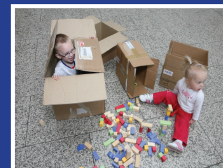
Toddlers from Docklands engaged in early numeracy play with cardboard boxes and wooden bricks!