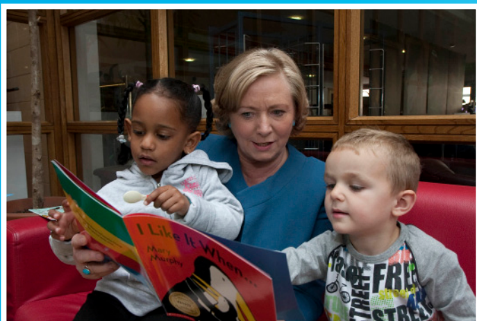
Ms Frances Fitzgerald T.D., Minister for Children and Youth Affairs takes a moment to read a story with children from Docklands, at the Evaluation Report Launch in May 2011.

http://www.tcd.ie/childrensresearchcentre/assets/pdf/PublicationsDevelopingEarlyYearsProfessionalism.pdf