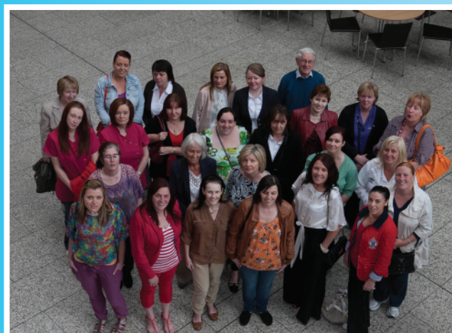
ECCE workers from Docklands who were involved in the programme and who attended the Evaluation Report Launch in May 2011