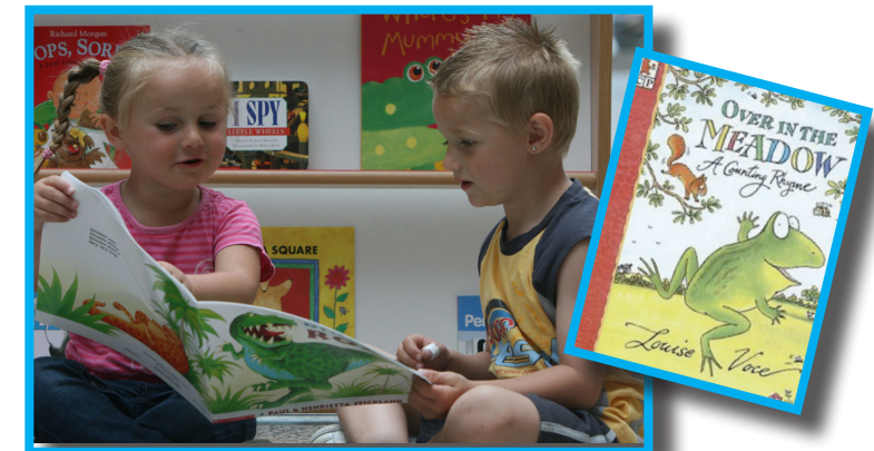
Docklands pre-schoolers enjoy reading together

It is important that young people, and their parents, consider this when deciding what level Maths to do in Secondary school. It is advisable to speak with the Maths Teacher and also to the Guidance Counsellor, in case the decision limits choices at a later stage.