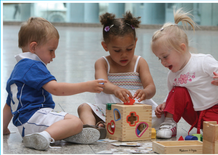
Children from Little Treasures Community Crèche concentrating on their early numeracy activities

Link different shapes to common objects 'That square block is shaped like our cheddar cheese!'