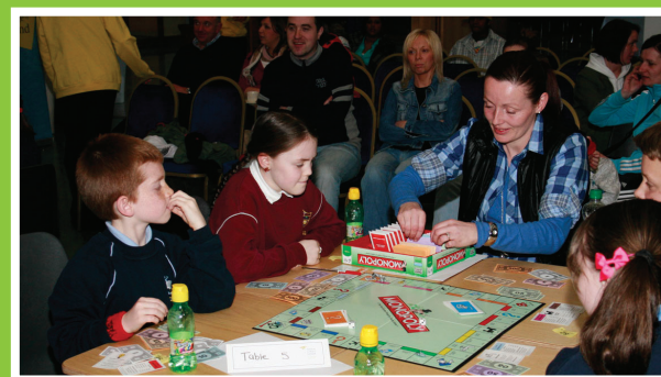
Primary school children from Docklands compete at the NCI Monopoly Challenge, supported by a parent volunteer

The NCI Primary Challenge Events encourage the children to play boardgames in the classroom and give them the chance to come to NCI and represent their school. Watch out for the Table Quiz in December and the Monopoly Challenge in March where children from 3rd & 4th class in Docklands will be competing!