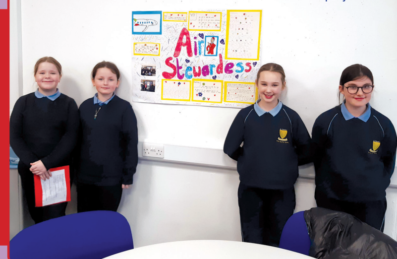
Students from St Vincent's Girls NS with their careers project.

Congratulations to the 200+ students from primary and second level that took part in the Education Guidance school programme and exhibitions at NCI in March 2023. Volunteers from local companies judged the projects and visited schools to bring their feedback and talk about their career paths. Thanks also to the NEIC Initiative for funding this project at second level.