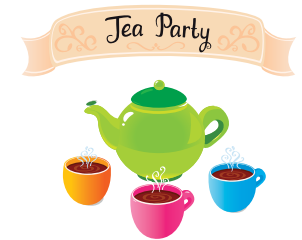
Aistear Theme Identity & Belonging

Join your child in early years setting for a fantastic Tea Time Party.