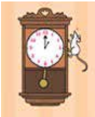
Aistear Theme Communication

Hickory dickory dock, the mouse ran up the clock. The clock struck one, The mouse ran down, Hickory dickory dock.