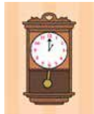
Aistear Theme Communication

What does the clock in the hall say...? Tick tock, tick tock What does the clock on the wall say...? Tick, tock, tick tock, tick, tock What do the watches all say...? Tick-a-tick-a-tick-a-tick-a-TOCK!