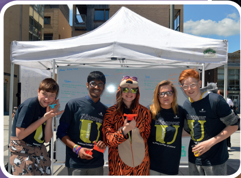
Above: Students made and sold their own lemonade as part of a business project called ‘Citrus Saturday’

37 students graduated the Discover University summer programme in June 2015