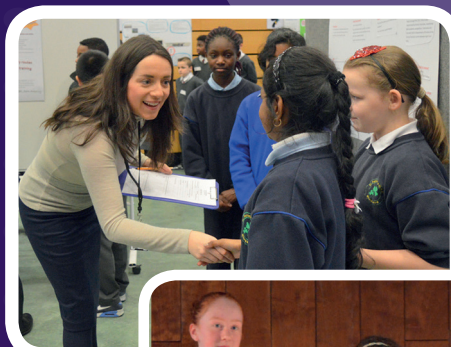
Below: Judge meets students at the ELI Educational Guidance Exhibition