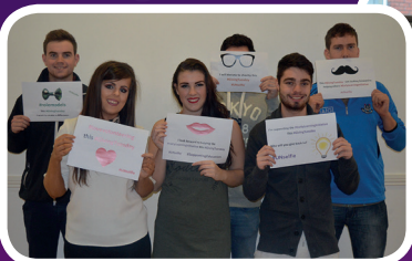
Above: NCI students take part in the #GivingTuesday campaign

Programme provides financial, personal and career development support for students who in return participate in the work of ELI as role models to younger students.