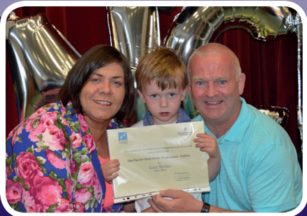
Above: PCHP Graduation June 2015

Parent Child Home Programme (PCHP): 18months – 2 ½ years