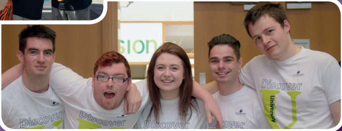
Above: Third level students acted as team leaders and mentored a group of students for the Discover University programme

Above: Students took part in a new computer project called ‘Imagine 3D Challenge’ where they learnt the basic of 3D modelling and printing