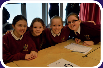
Above: NCI Quiz Challenge March 2015