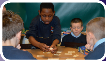
Above: St Patrick's Boys' N.S practice playing Rummikub