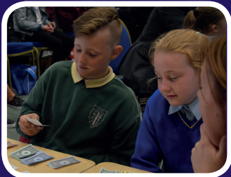
Above: NCI Monopoly Challenge May 2015

297 children in 2nd, 3rd & 4th classes spent at least 2,200 hours playing board games and taking part in quizzes for the NCI Challenges.