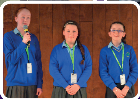
Right: St Patrick's Girls NS (Ringsend) give a presentation in Facebook offices