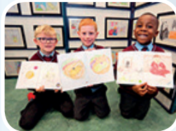
Above: St Laurence O'Toole's Junior Boys' School Exhibition